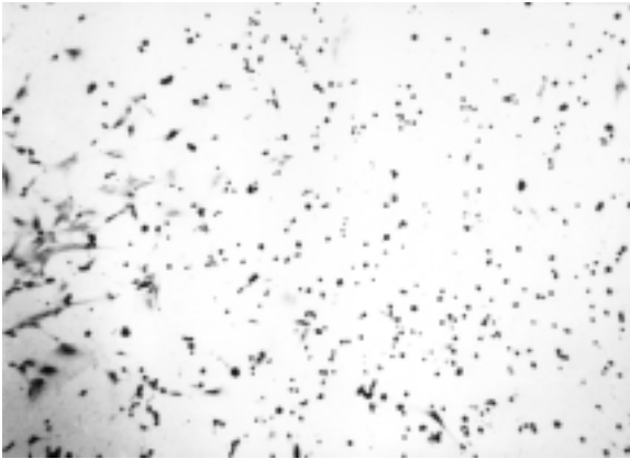
Fig. 1. Normal human astrocytes, exposed to silver nylon for 8 hours showing the boundary zone formed by the diffusion of the free silver ions from the silver nylon, 40X. The silver nylon square had been applied over the right quarter of the frame and unaffected astrocytes are visible in the left quarter of the frame.

In the experimental cultures with silvered nylon discs, beginning during the initial hour of exposure, the diffusion of free silver ions from the disc could be followed by changes in the cell morphology which produced a definite boundary zone between the area of the culture not yet exposed to the silver ions and the area in which the cells were exposed to the silver ions (see Fig. 1). In this latter area the cell bodies became round with highly basophilic nuclei with a thin rim of basophilic cytoplasm. Some level of substrate adhesion was maintained in the majority of the cells exposed to the silver ions. The long cell processes appeared to separate from the cell body and fragment into round cytoplasmic vesicles of variable size, sometimes appearing as a chain along the original path of the process.