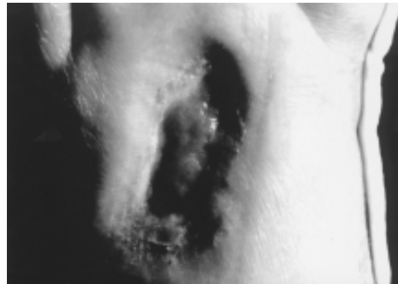
Fig. 4. Case #1, Ten weeks from start of the silver nylon treatment, the entire ulcer is now filled with active granulation tissue.

the beginning of silver treatment all antibiotics were discontinued. The steroid therapy was continued in order to be subsequently slowly withdrawn. Cultures from the left foot ulceration had been reported as negative, however slides made from the eschar revealed a population of unidentified gram positive cocci. Control of the blood sugar levels with insulin was extremely difficult. Silver nylon treatment of both lesions, right hand and left foot, was begun simultaneously.