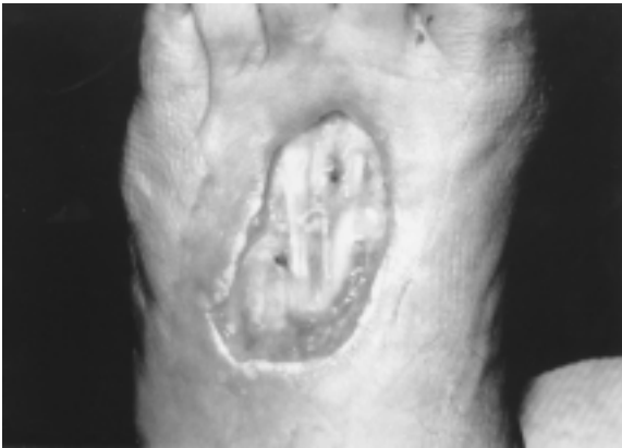
Fig. 2. Case #1, ulceration, left foot at start of silver treatment. The lateral border of the foot is to the left in the photograph and this same orientation is present in the remainder of the photographs of this case. The central area of the ulcer was covered by an adherent, yellow eschar imbedded in which are visible a number of extensor tendons. A narrow zone of apparently active tissue destruction is visible particularly in the proximal area.

The cases varied widely as to underlying condition and complicating circumstances and the results are not amenable to a simple tabular presentation. Case #1 is presented herewith in a complete clinical summary. The remaining cases are presented as clinical abstracts.